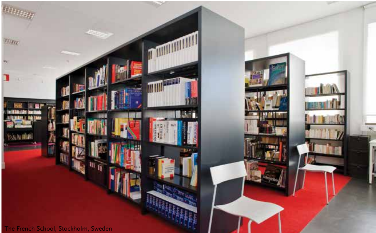
The French School, Stockholm, Sweden