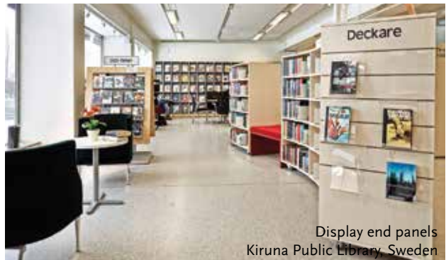
Display end panels Kiruna Public Library, Sweden