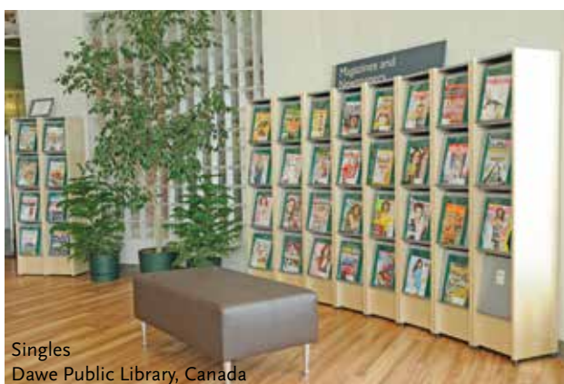
Singles Dawe Public Library, Canada