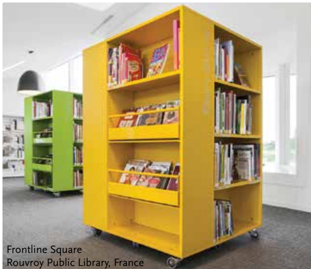
Frontline Square Rouvroy Public Library, France