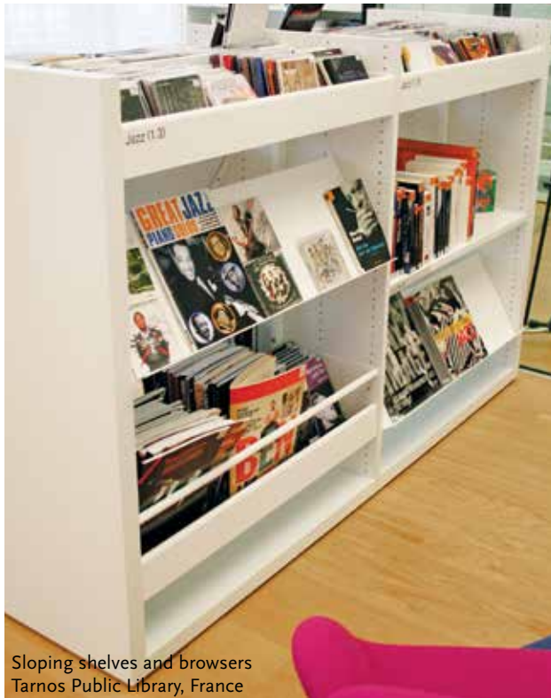
Sloping shelves and browsers Tarnos Public Library, France