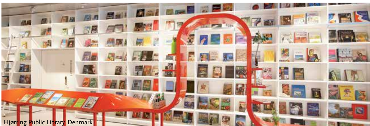
Hjørring Public Library, Denmark