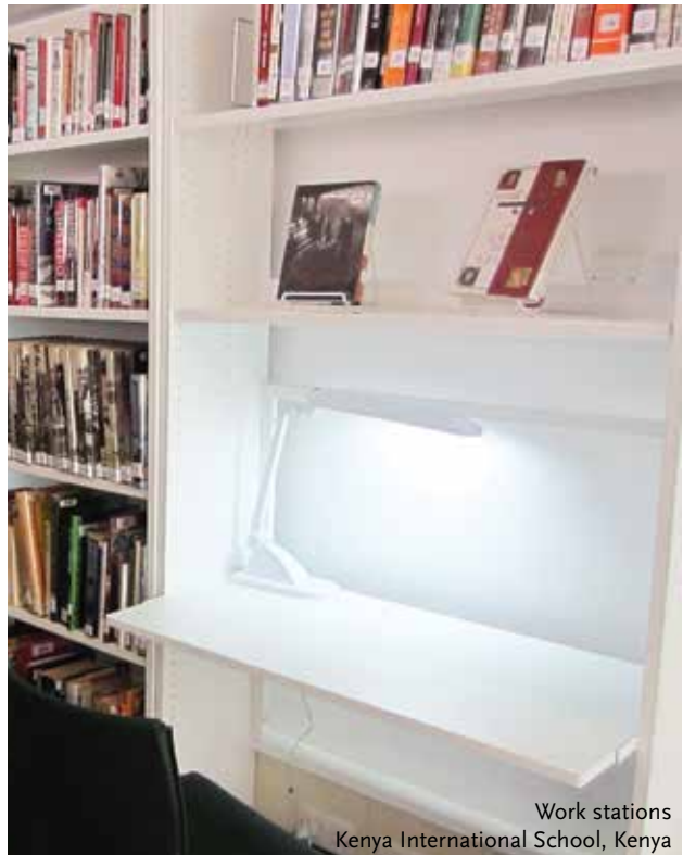
Work stations Kenya International School, Kenya