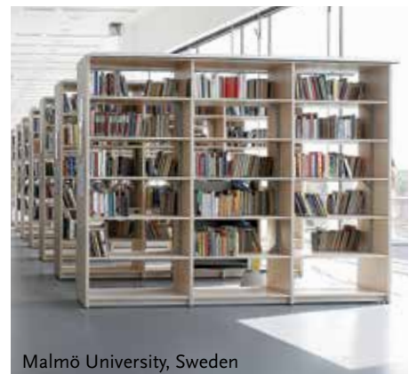
Malmö University, Sweden