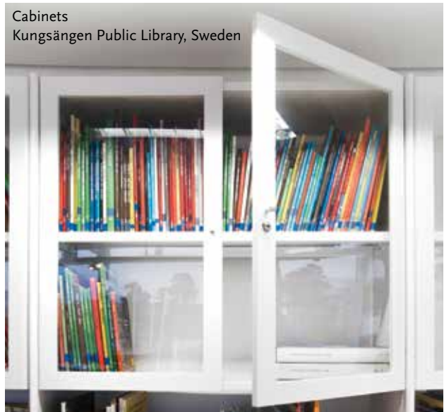
Cabinets Kungsängen Public Library, Sweden