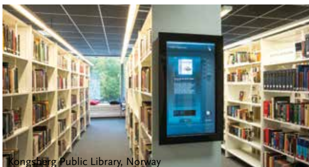
Kongsberg Public Library, Norway