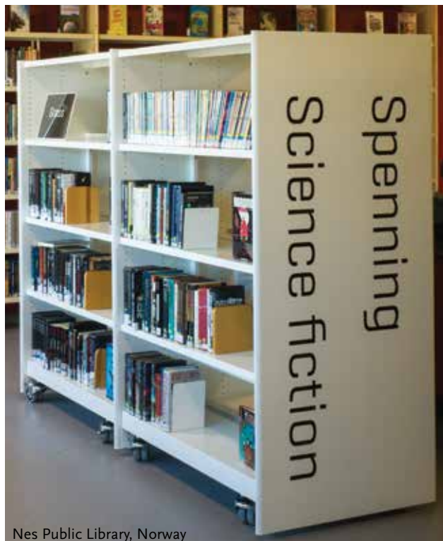
Nes Public Library, Norway