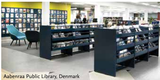
Aabenraa Public Library, Denmark

Here are examples of projects with Frontline shelving system. Visit www.wearelibrarypeople.com for more photos and inspiration.