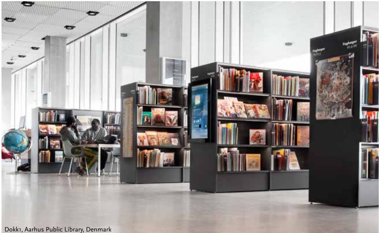
Dokk1, Aarhus Public Library, Denmark