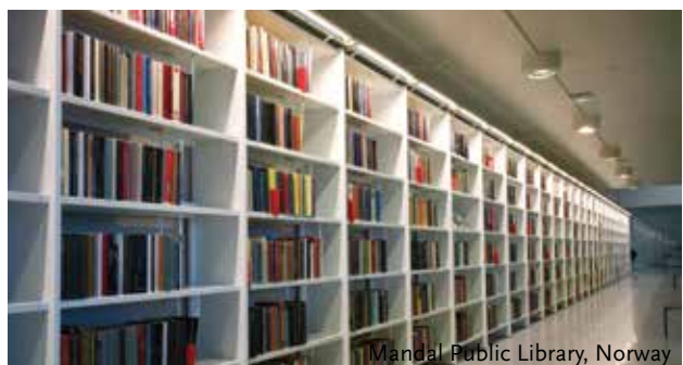
Mandal Public Library, Norway