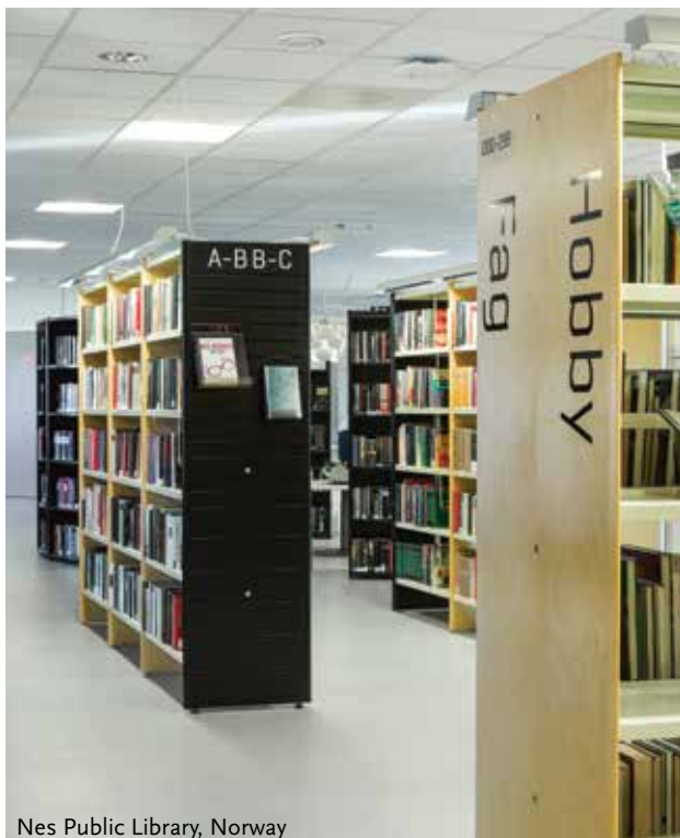
Nes Public Library, Norway

Here are examples of projects with Softline shelving system. Visit www.wearelibrarypeople.com for more photos and inspiration.