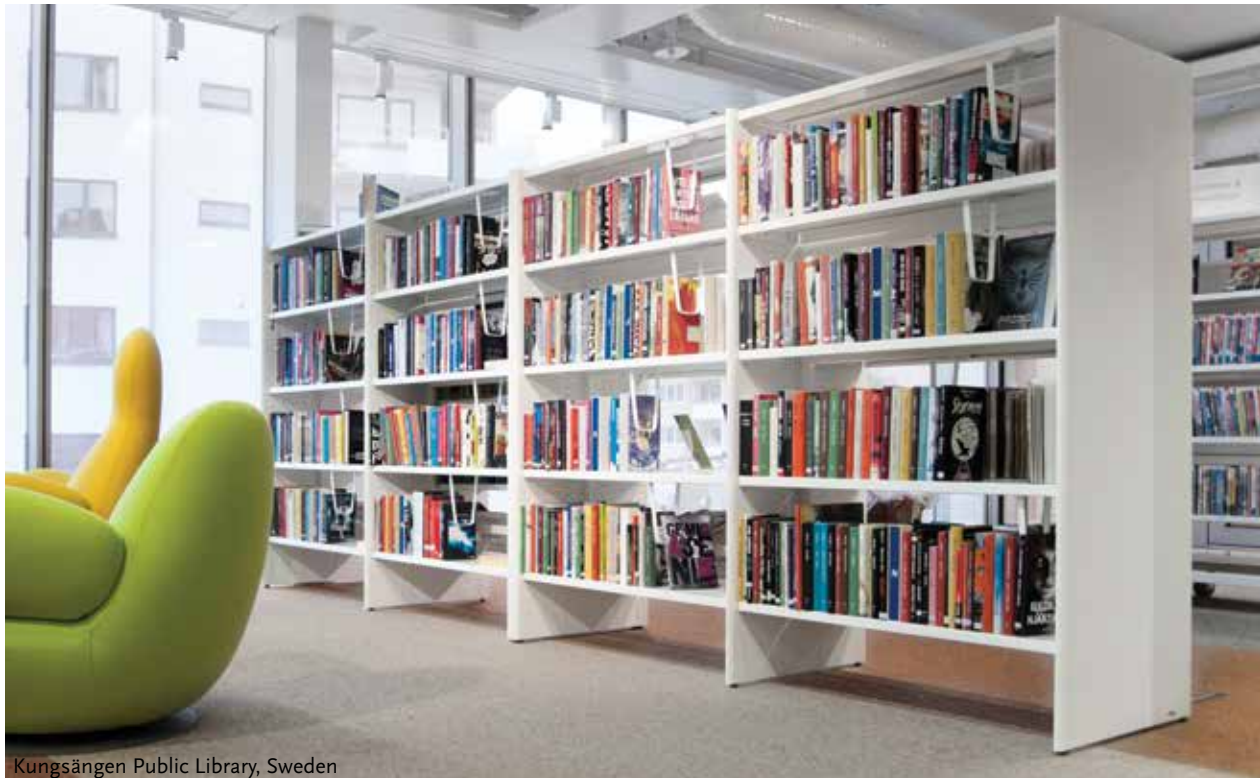
Kungsängen Public Library, Sweden